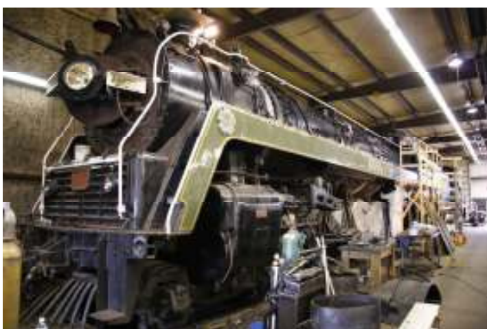
Inspecting the smokebox after nose cone removal

It is early November and Locomotive 6060 is in the shop awaiting the winter works program to start up. CMO Harry Home, Larry Potter and Zac Brewer have opened up the nose cone to inspect the smokebox area.