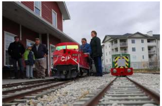
Iron Horse Park's scale train ready for riders