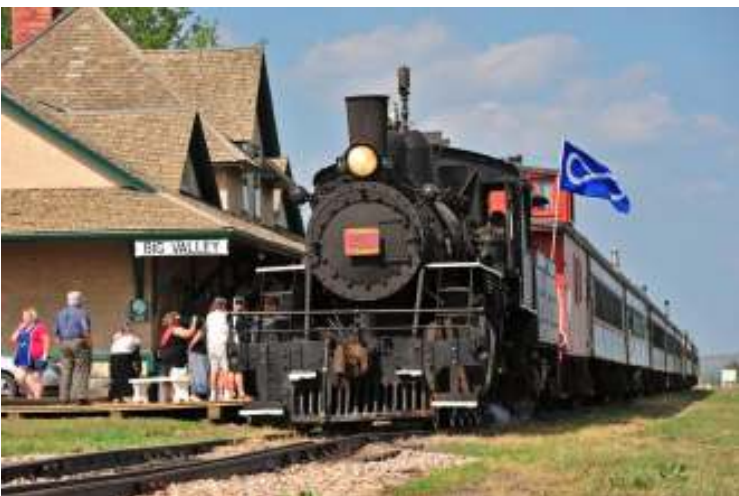
APST's Engine 41 arrives at Big Valley