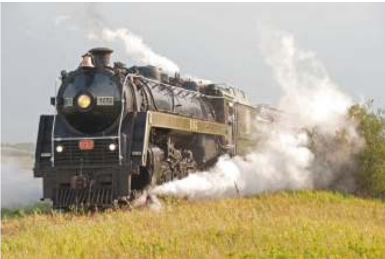
6060 departing northbound from Big Valley