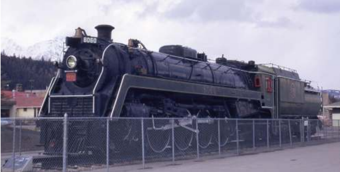
The 6060 (without conical nose) unrestored and on static display in Jasper, Ab.