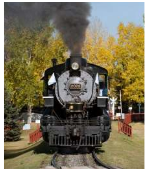
Heritage Park's 2023