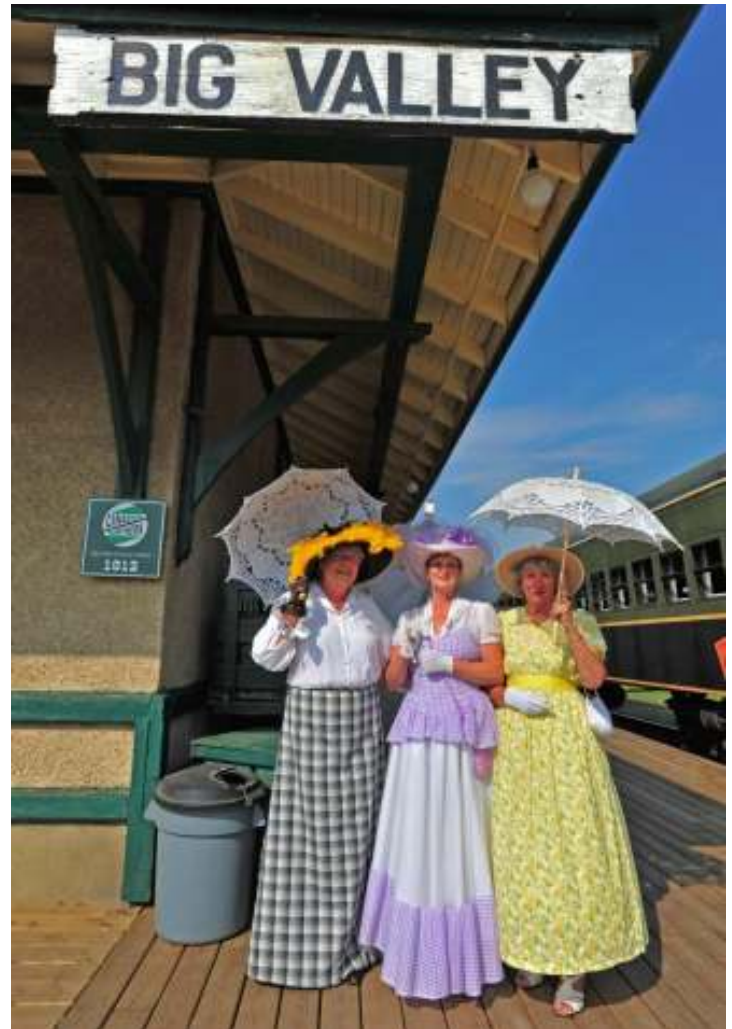
Ladies from the Big Valley Historical Society greet the arriving passengers during August RailFan Weekend