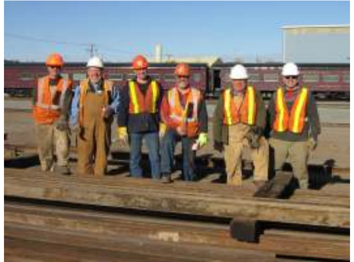
Some of the crew from the first weekend