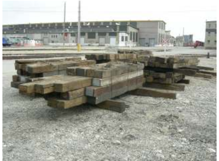
Bundling of the ties