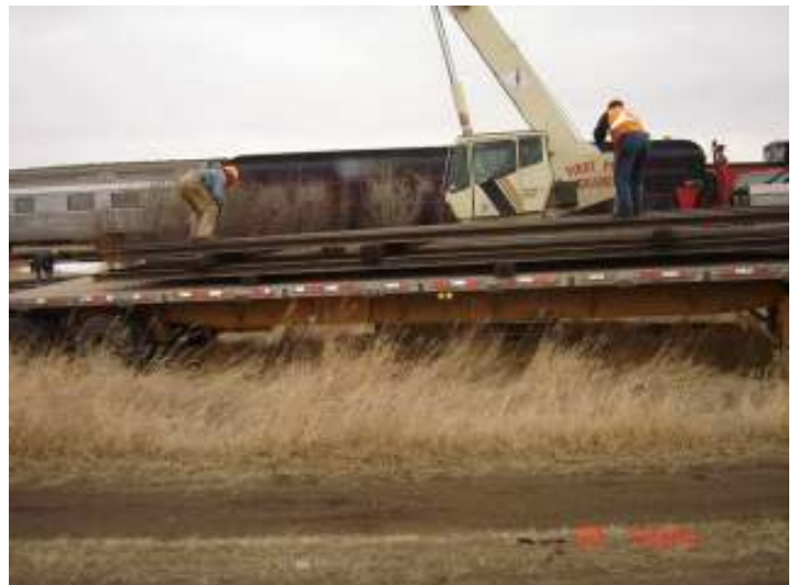
Unloading the first transport loads