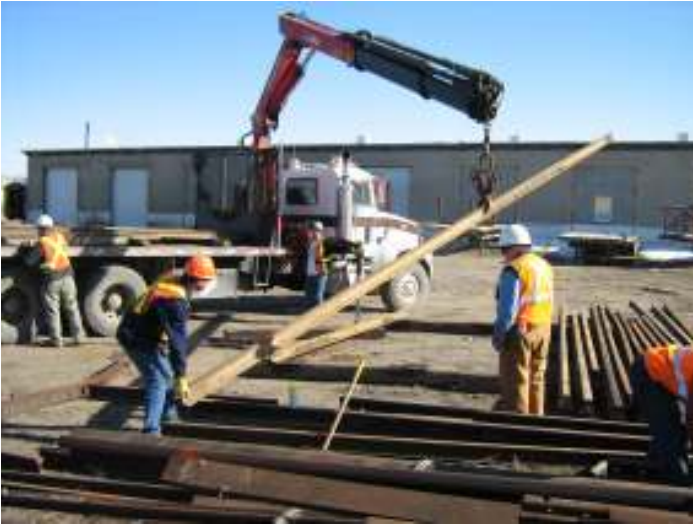
Sorting the rail by size and weight