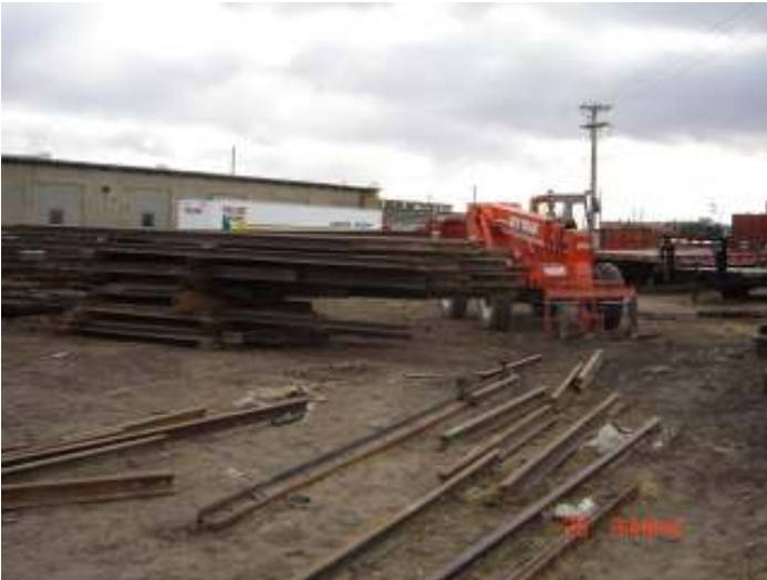
Sorting of rail made easier with a telehandler