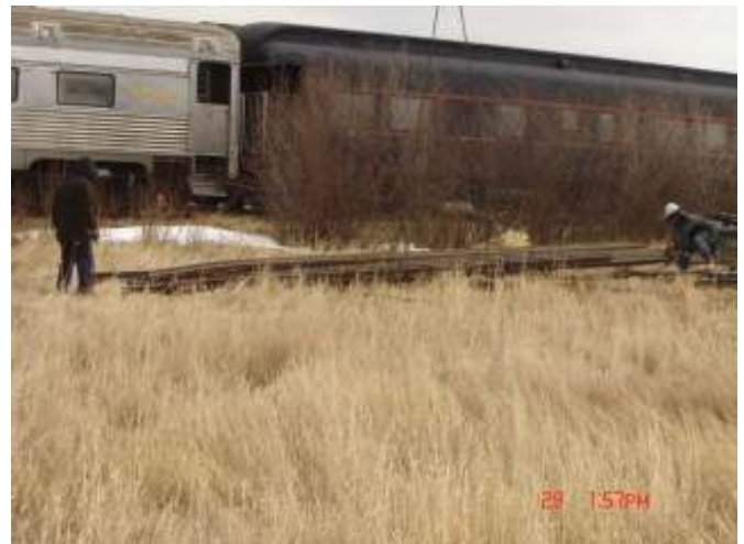
Unloading the last of the rail