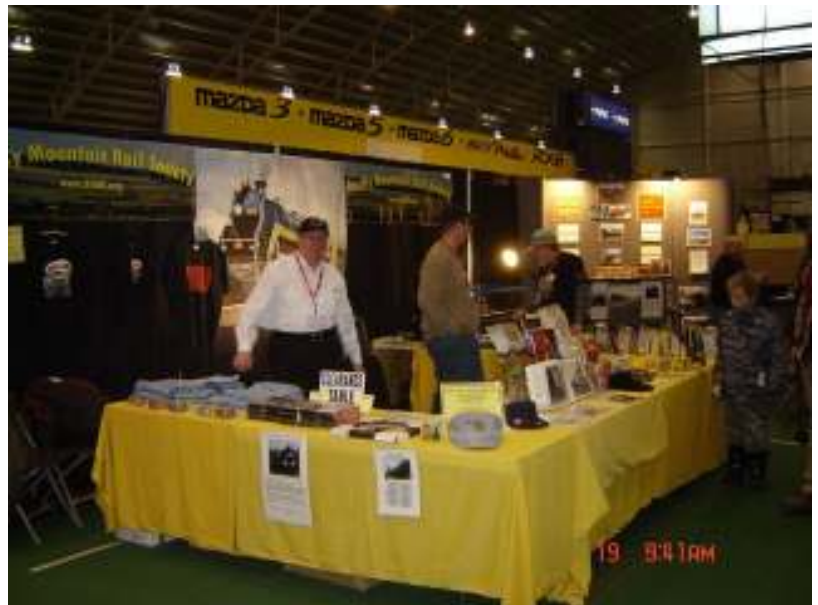
The RMRS booth at the Supertrain Show

Supertrain was held in April this year which is a change from years gone by. It was also held at the Soccer Centre in Calgary. This greatly expanded the size of the event. There were wonderful displays of model railroading, photos, you name it. Rocky Mountain Rail Society and Alberta Prairie Steam Tours shared the biggest booth in RMRS history at Supertrain. It was an unqualified success for the society. Supertrain has been a great fund raiser for the society and this year was no exception. This year also saw a number of new members join the society. To all our new members welcome. We had tremendous support from our volunteers this year from the set up to the tear down everything went smoothly. I would like to say a personal thank you to the Calgary Modellers who organize this event each year. They continue to do a great job setting up this event. In closing I would like to thank all members who supported this great event. The organizing committee looks forward to next year. Have good one.