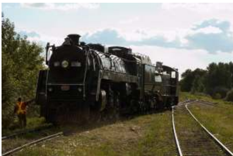
6060 sees daylight for the first time in 9 months as she is pulled out of the West Stettler shops