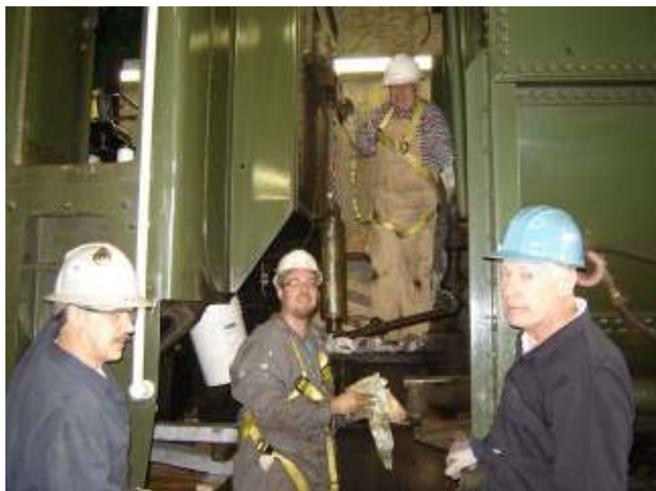
RMRS Volunteers about to install the 200 lb+ pin that connects the engine and the tender