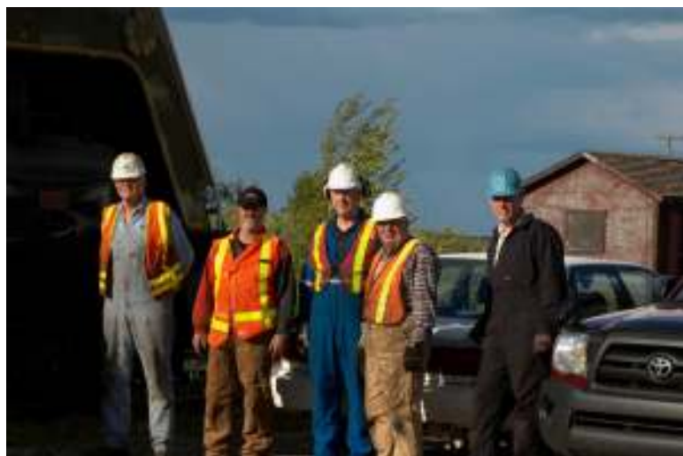
RMRS Volunteers who completed the final preparations for steam-up