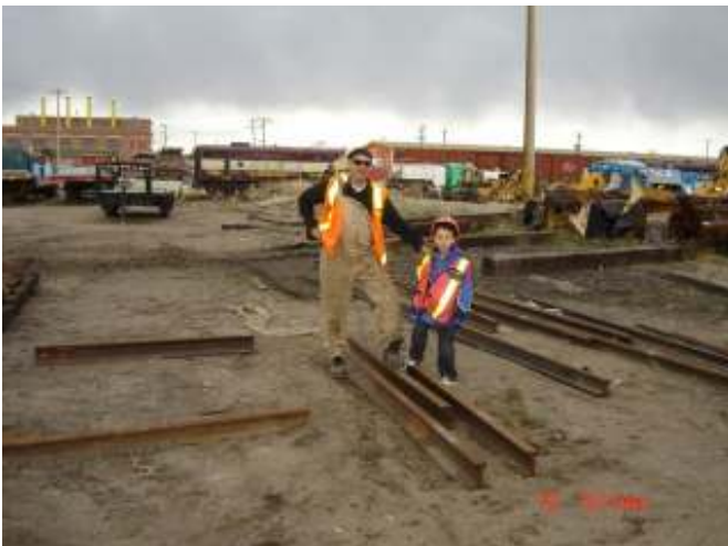
The last of the rail to leave Ogden